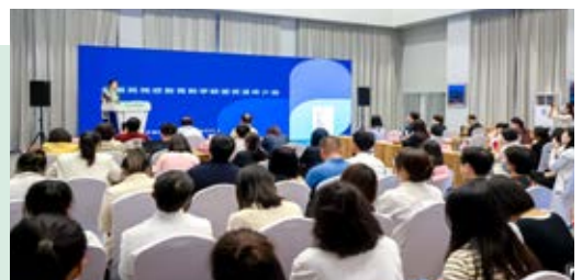
▲ The First Forum "Assistive Devices on Campus"