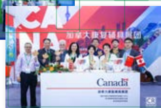
▲ Canada Pavilion