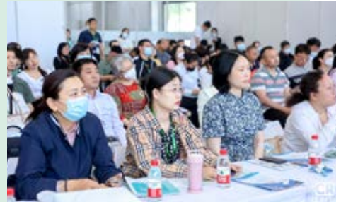
▲ New Technology Development of Children Rehabilitation