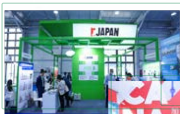
▲ Japanese Pavilion

Different countries like Germany, France, Canada, the United States, Japan, Belgium, Denmark, Sweden and Switzerland.