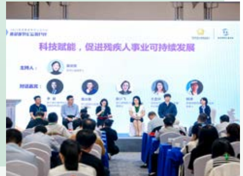
▲ The First Forum on Foundation for the Disabled