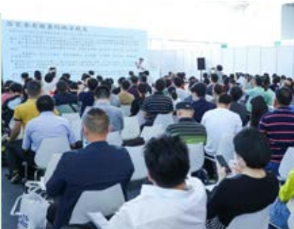
▲ Seminar on Innovative Development of Community-based Smart Elderly Care